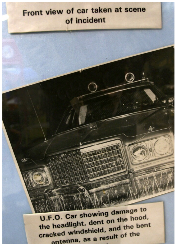
Photo taken of Johnson's cruiser the night he reported the incident.

Brakes slam and just before the deputy blacks out he hears the sound of breaking glass.